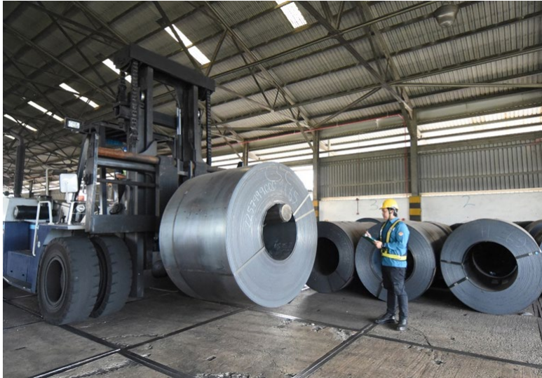
Photo caption: In August 2024, Northport handled a total of 1,145,021 FWTs of conventional cargo, surpassing the previous record of 1,143,318 FWTs set in July 2024.